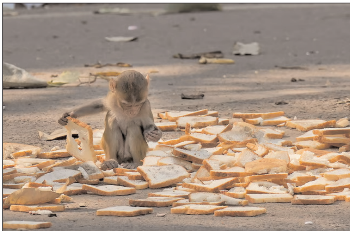
A baby monkey eats a slice of bread by the side of a road, in New Delhi.

The AQI was in the 'very poor' category on Saturday and Friday as well.