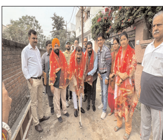
Arvind Gupta pledges to transform Jammu West into a Model Constituency