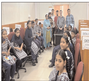
GDC Marh hosts Maiden Computer Literacy Program at GM School Dhateryal