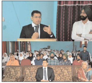
Education Department celebrates National Education Day at Girls Higher Secondary School Poonch